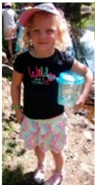
◀ A young naturalist explores the banks of the Ashuelot River during a Kids on Campus summer camp program, cosponsored by the Harris Center and KSC.

The Harris Center's education staff also partnered with KSC's Kids on Campus and Cheshire Academy for Lifelong Learning programs to offer learning opportunities for curious naturalists age 3 to 93 in 2016.