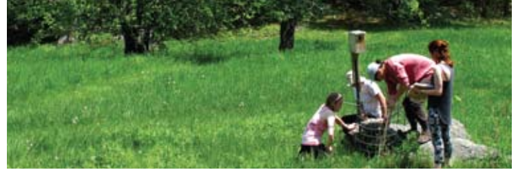
▲ Checking on the Chestnuts In 2015, the Harris Center planted 10 blight-resistant American Chestnut trees on our conserved lands. In 2016, the KSC conservation interns checked the plantings — recording information on their location, height, and condition — as part of a status update for the American Chestnut Foundation.